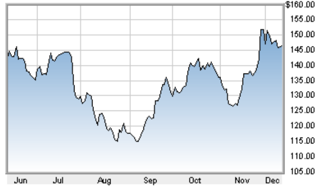
ALLEGiant TRAVEL CO as of 12/13/2017