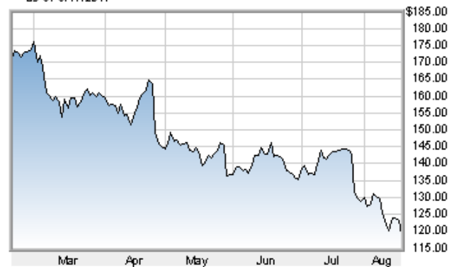
ALLEGiant TRAVEL CO as of 8/17/2017