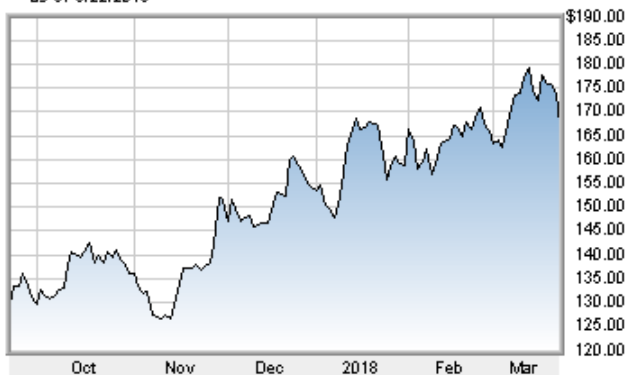
ALLEGiant TRAVEL CO as of 3/22/2018